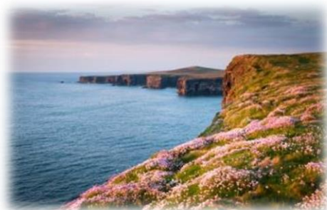
Views of The Cliffs of Moher