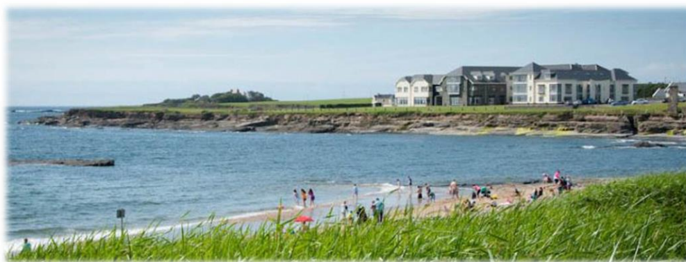
Beach at Spanish Point