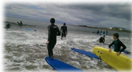
Surfing at Spanish Point beach